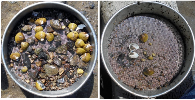
Samples from Deas Slough. The sample on left is from the beach in front of the logs and the right sample is from behind the first log.

Shells collected at six of the seven locations ranged in maximum size from 15 to 25 millimeters, however, the shells collected from the Deas Slough, at Deas Island Park, were giants compared to the rest, with the largest specimen from there measuring an unbelievable 40 millimeters. The size of the clams became smaller the further from the mouth of the river they were located and those found in the Pitt River were the smallest of all. My theory of tidal dispersal upriver from McDonald Beach seemed to hold true until I came to the Deas Island location. Now I wonder