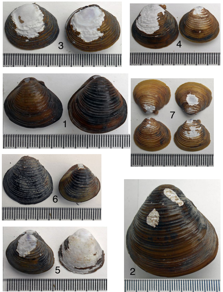
Largest specimens collected at each location shown to scale with numbers corresponding with those on map and in article. [1] McDonald Beach - [2] Deas Island - [3] North Arm Storage Park - [4] West of Nelson Road - [5] Maquabeak Park - [6] Mouth of Coquitlam River - [7] Pitt River

C. fluminea is a fouling clam, and anyone drawing water from the river for industrial cooling, drinking water or irrigation should be made aware of its presence. I shall continue to track the species and will note any newly discovered locations.