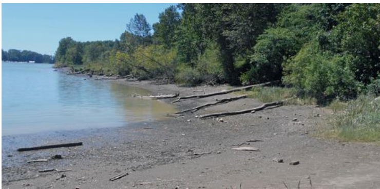
Logs on the shore along Deas Slough - Silt that settles on the downstream side of the logs appears to hinder the survival of the clams.