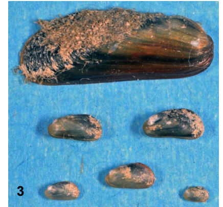
1 Entodesma navicula – top 6.0 mm, bottom left 4.4 mm, bottom right 3.3 mm 2 Musculus taylori – top left 3.1 mm, bottom left 2.6 mm, bottom right 5.1 mm 3 Adula sp. – 1.6 to 13mm 4 Alvania compacta - 2.2 to 2.5 mm 5 Modiolus modiolus - 1.8 to 2.3 mm 6 Crenella decussata – left 2.3 mm, right 1.3 mm